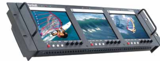
V-R563P-SDI Users Guide

1910 East Maple Ave. El Segundo, CA 90245 Tel.: 800-800-6608 • Fax: 310-333-0688 www.LCDRacks.com Email: sales@lcdracks.com